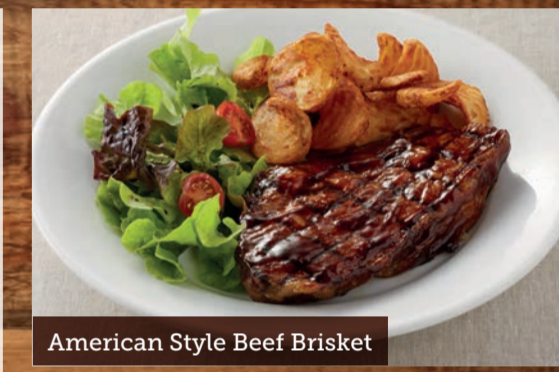
American Style Beef Brisket

Pork Ribs $35.95 A generous rack of pork ribs grilled in your choice of marinade: barbecue, teriyaki or honey soya. Served with golden sidewinder wedges and mixed lettuce.