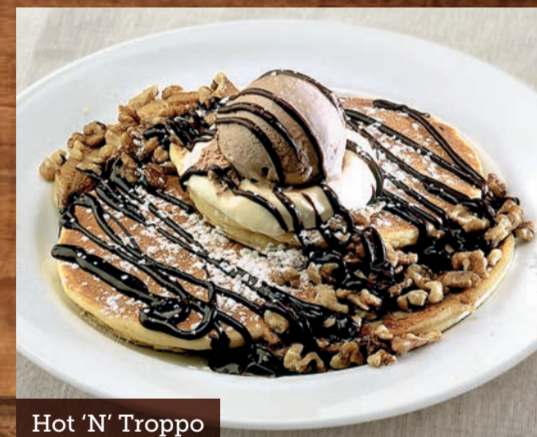
Hot 'N' Troppo