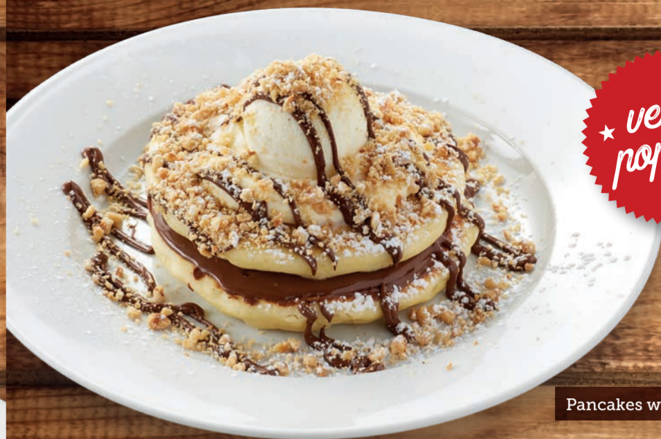
Pancakes with Nutella

Pancakes with Nutella* $15.95 Buttermilk pancakes with Nutella, topped with cream, vanilla ice cream, and roasted hazelnuts. *LG option available Add $1.00