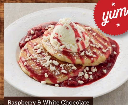
Raspberry & White Chocolate