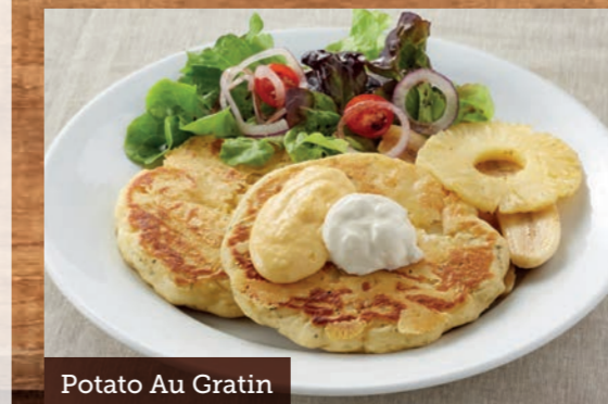
Potato Au Gratin

Potato Au Gratin* $16.95 Potato and onion pancakes topped with a tasty cheese melt. Served with grilled banana and pineapple, topped with our hollandaise sauce and sour cream. *LG option available