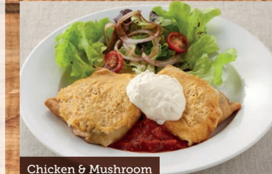
Chicken & Mushroom

Mexicana $15.95 Spicy Mexican beef sauce, spicy tomato salsa, special tomato sauce, tasty cheese, guacamole, sour cream and shallots, served on a bed of mixed lettuce...one of our best sellers!